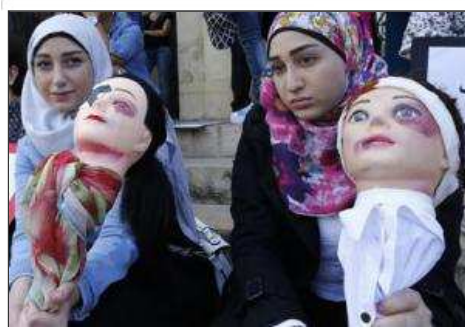
Victims of violence are still reluctant to confide about their ordeal

Women's life expectancy now reaches 72 globally, compared to 68 for men.